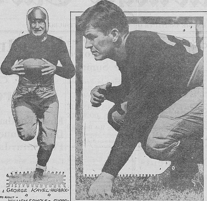
Tartan veterans who will lead opening battle against Geneva in the Stadium on Saturday.